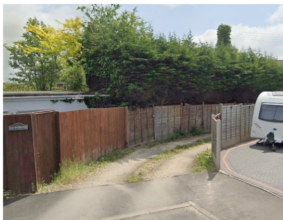
Drive leading to parking

Drive past cottages on your right and turn right into Loughmill Road. Turn right into Bedford Close and follow road round to the right. Access into the drive for the cottage is on the left at the end of the cul-de-sac. The allocated parking space is the first space on the left.