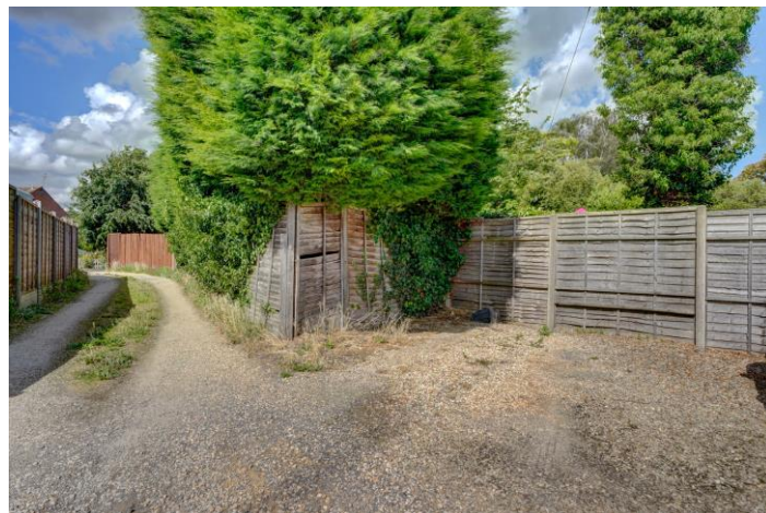
Parking space is first on left