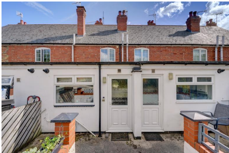
Rowan Cottage, 7, Worcester Road, Pershore, WR10 1HQ